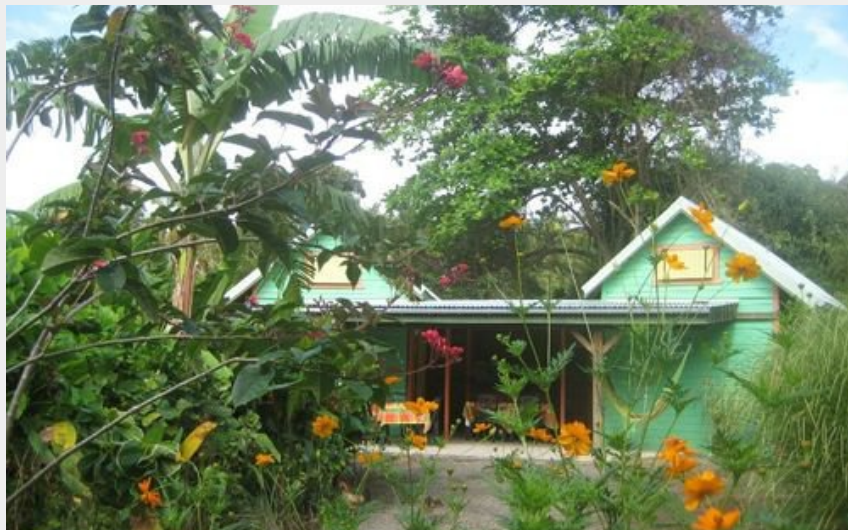
Attribution : (An Ti Kaz La)