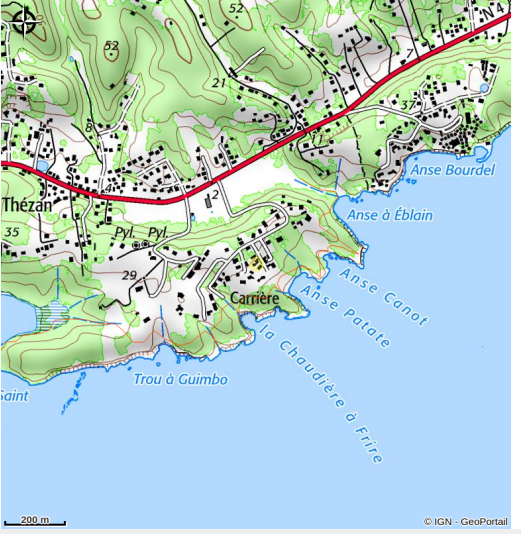
Attribution : (Iguane House)