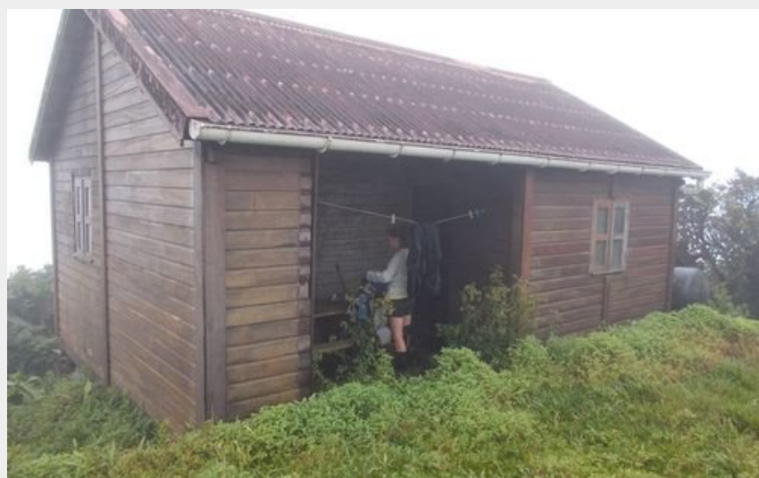
Attribution : refuge Morne Frébault - Matélieane (PNG)