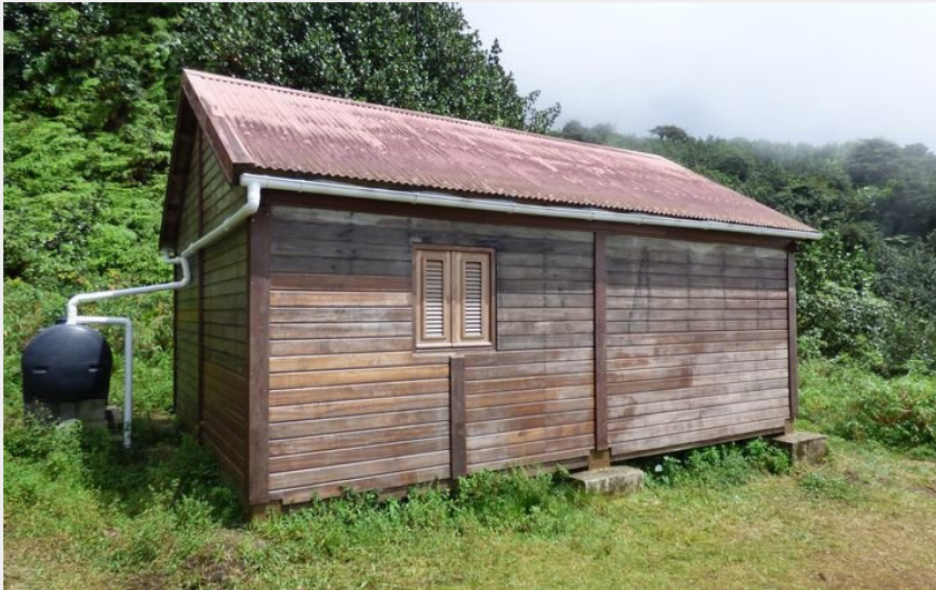
Attribution : refuge de La Citerne (PNG)