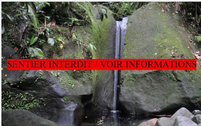
Petite cascade "Grosse Corde" (AAMG)