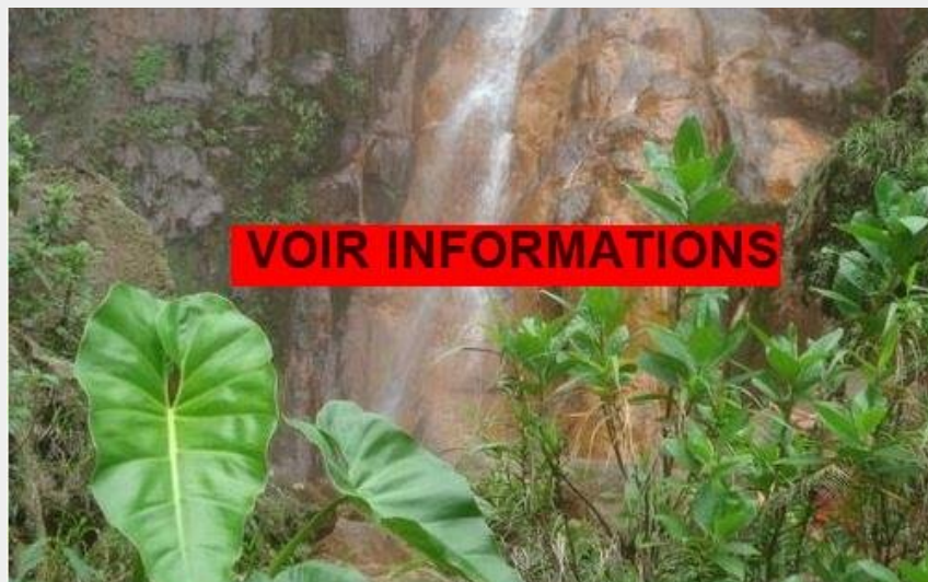
La Première Chute du Carbet