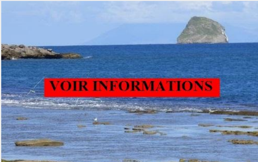
pêcheur face à l'Ilet Tete-à-l'Anglais (PNG)