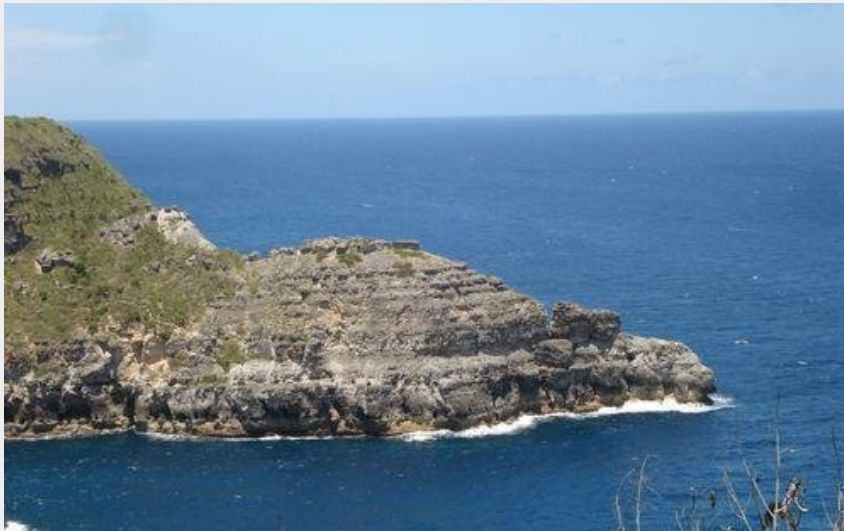
"La Tortue" (PNG)