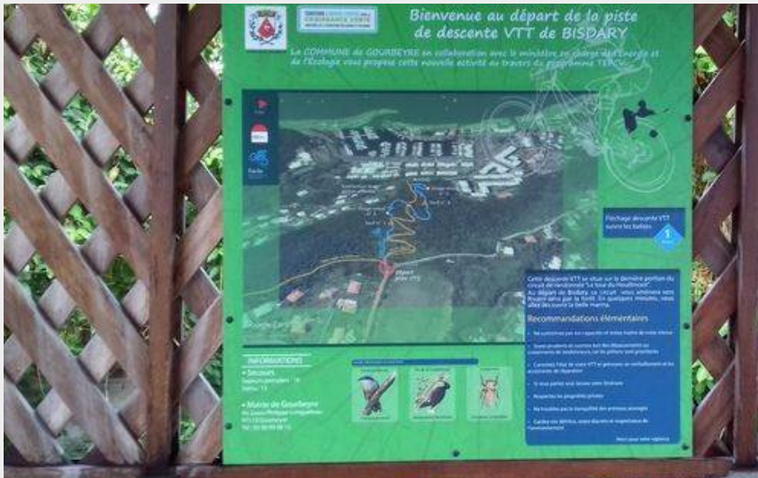
panneau départ (PNG)