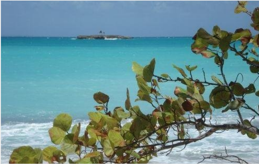
l'îlet de Vieux Fort (PNG)